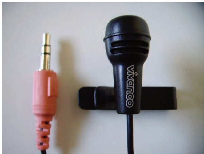
Figure 1: Small and practical clip microphones do not handicap the speaker at all.

programmed two almost identical front ends for Gnome/XFCE and KDE: Gtk-recordmydesktop and Qt-recordmydesktop. Both are available as pre-built binary packages for most distributions.