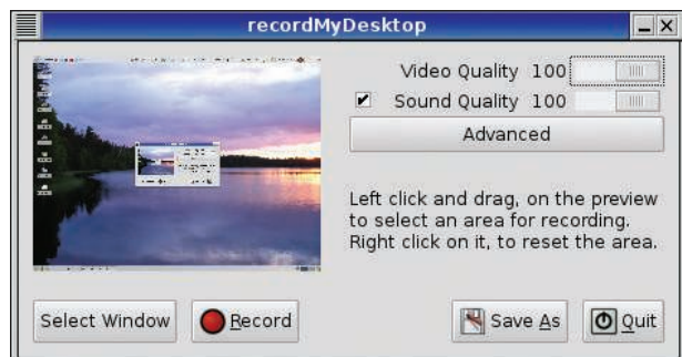
Figure 2: The clear-cut settings and start menu in recordMyDesktop.

The microphone needs a stereo jack; if you use a mono jack, a modern sound card will only record on one channel. On top of this, PC sound cards are not designed to support just any input impedance.