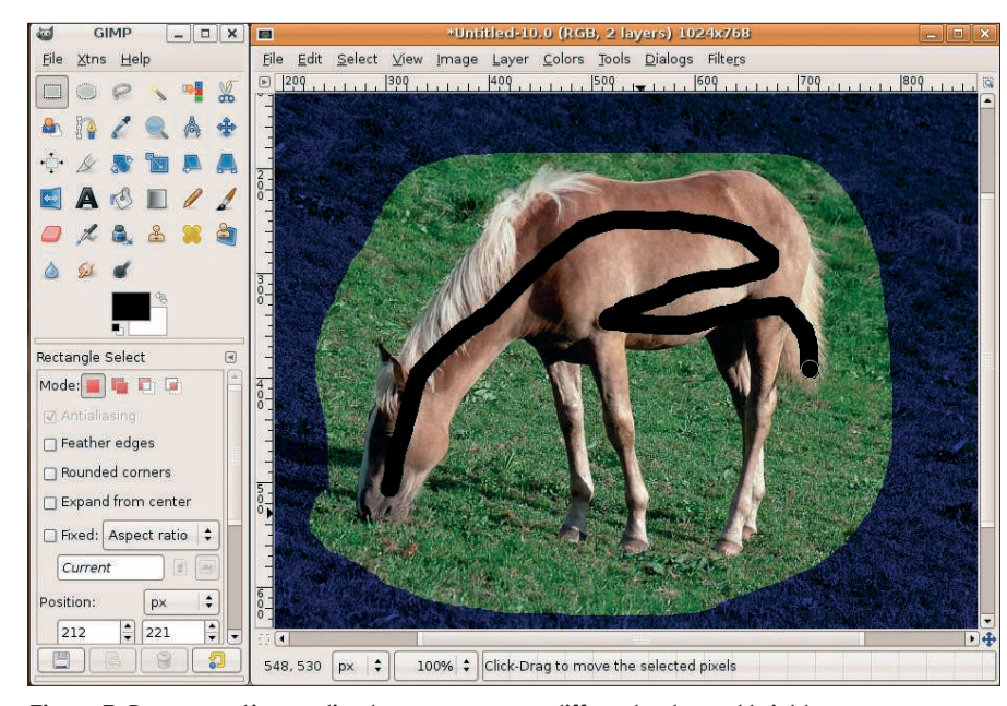
Figure 5: Draw a continuous line to cover as many different color and brightness areas as possible.

Extraction works well with just a couple of easy steps; however, if the results