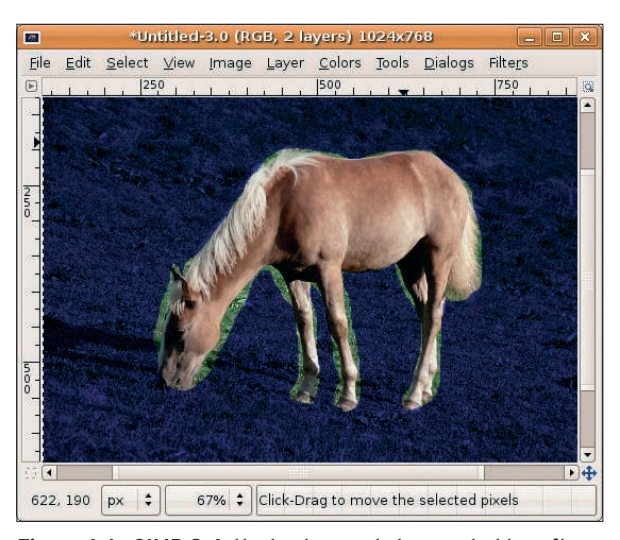
Figure 4: In GIMP 2.4, the background changes to blue after you trace the contours of the foreground object with the lasso tool.

at the console. Users with openSUSE can type yast -i gimp ; if you have Fedora, the command is yum install gimp .