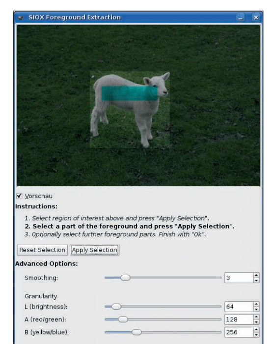
Figure 3: Select the image component you want to extract by holding down the left mouse button and dragging to draw a rectangle.

To install GIMP 2.4 on Ubuntu and Debian, type sudo apt-get install gimp