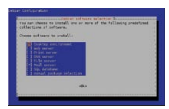
Figure 1: The Debian installer offers several package schemes based on the intended use of the system.

If you prefer a manual approach to partitioning, Debian gives you that option, although the icons are a bit confusing at first. You might like to read the detailed help page before you do this. Ext3 is the default filesystem, with Ext2, ReiserFS, JFS, XFS, and FAT available as options.