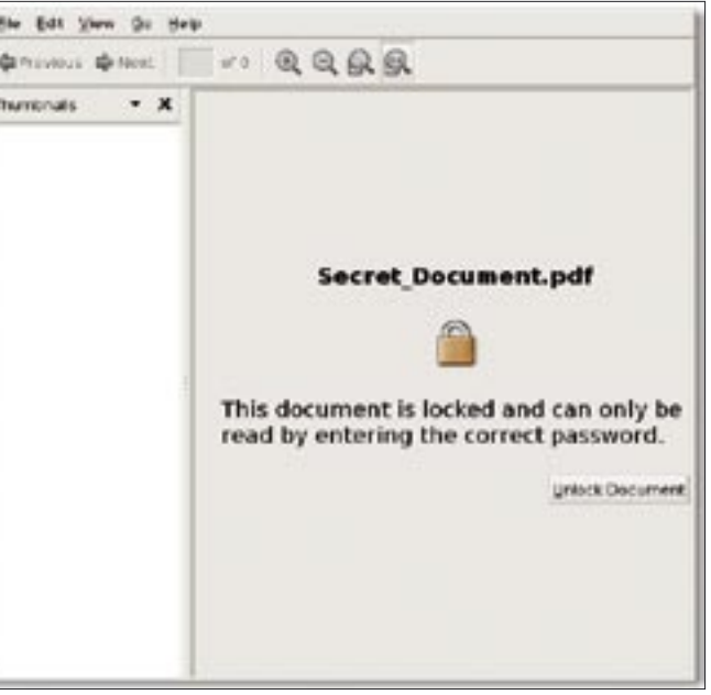
e 4: Evince supports PDF features such as password protection.

this kind of feature is referred to – is part of the Gnome guidelines.