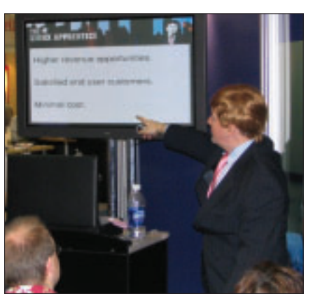
Figure 2: The Donald passes on some wisdom.

The conference portion of the show had tracks on security, system and application management, integration, kernel and cluster issues, emerging technologies, data clusters, client-side Linux, and the business case for Linux and open source. The business track, which is often the vaguest and least interesting option, took on new urgency with the recent emphasis on patent issues.