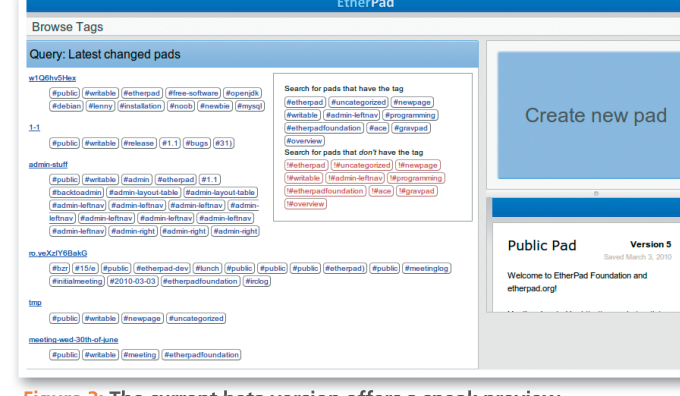
Figure 3: The current beta version offers a sneak preview of future EtherPad features, including links to other pads and hash tag-based searches.