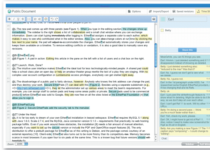
Figure 1: A pad in action: Editing this article in the pane on the left with a list of users and a chat box on the right.

Murmur is built on the Qt library and prefers a complete X Window System – which is annoying for admins on servers without a GUI. One possible work-