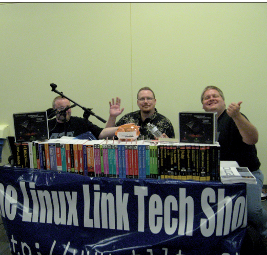
Figure 1: The Linux Link Tech Show booth on the expo floor.

The Ohio Linux Fest has long been considered a community-centric Linux gathering, and the 2009 incarnation of the festival proved not only that it's an exciting and important event but also that it's not afraid to expand its scope. With more speakers and special events than ever before, OLF managed once again to strike a balance between a fan-based social convention and a corporate-sponsored trade show.