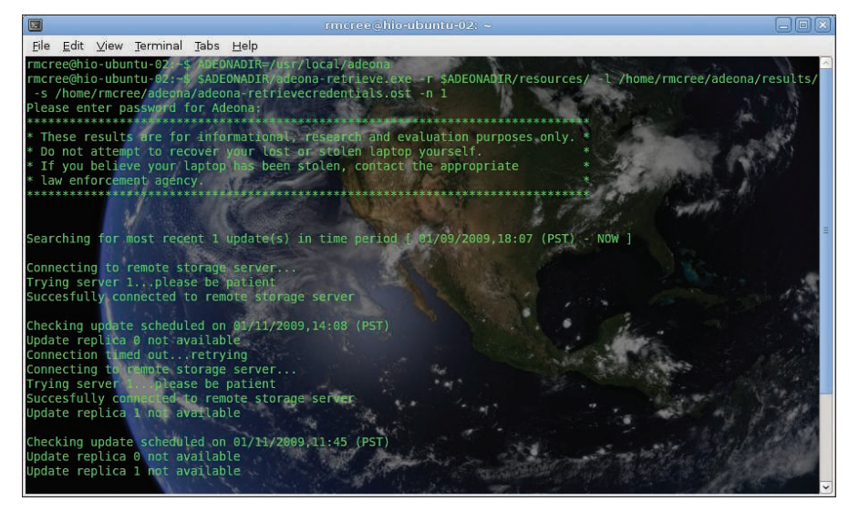
Figure 1: Retrieve your data from the remote storage server.