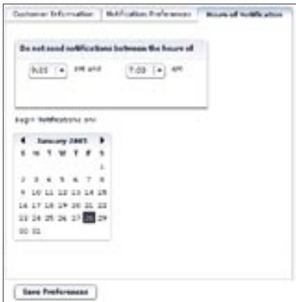
Figure 4: Flash Forms give you greater control over how users input their data.

Servlet applications while converting to CFML. You can incorporate CFML functionality into your existing JSP applications, for example, to take advantage of ColdFusion's charting or business reporting features. Conversely, if there are certain operations best performed by a JSP or a Servlet page, you can incorporate that functionality into CFML applications.