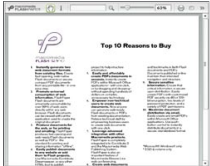
Figure 2: An example of a FlashPaper document embedded in a web page.

bars rising from the x-axis to the correct data point on the graph or pie charts fading into view. Each chart format allows for clickable area maps, which gives the user the power to assign URL values to chart segments. This feature gives you the possibility of creating drill down charts for Management Information Systems (MIS) or Decision Support Systems (DSS). ColdFusion offers many other chart type options. For instance, you can choose to include line, bar, pie, and scatter charts.