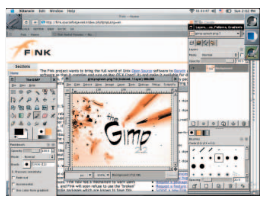
Figure 1: Fink installs the Gimp image manipulation program on Mac OS X.

would expect from a Linux system. Some packages are not available in binary versions, but the CVS or Rsync versions in the Fink repository are typically up to date. Users have the ability to build any programs they might be missing with a few shell commands. Fink has no trouble handling a mixture of binary and source packages (Figure 1). The premium models in the Fink package collection [6] are Wget, Apache, and Gimp.