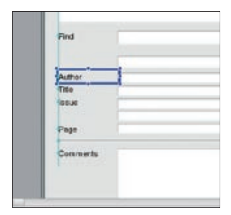
Figure 2: A cross hair cursor facilitates accurate positioning of GUI elements.

The binary packages were easy to install. Red Hat Desktop Linux and Novell Desktop Linux users can download the Realbasic RPMs; there is also a TGZ archive. Both variants work perfectly on any recent distribution. The PDF-based