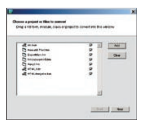
Figure 3: The Visual Basic converter converts projects to Realbasic format - but only on Windows.

Linux, which does not prevent the tools from being displayed in the toolbox.