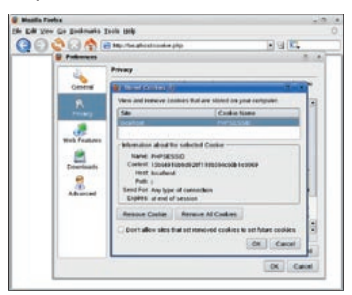
Figure 4: Web applications use cookies to identify users. It attackers can access these credentials via cross-site scripting, they can steal your identity.

Pharming is another extremely dangerous attack technique that reared its ugly head just recently. Pharming attackers exploit security holes in the DNS system. The browser first needs to resolve the URL before it can connect to a site. To do this, the browser first talks to a DNS server on the Internet. DNS servers reside in a hierarchy: the first port of call is the