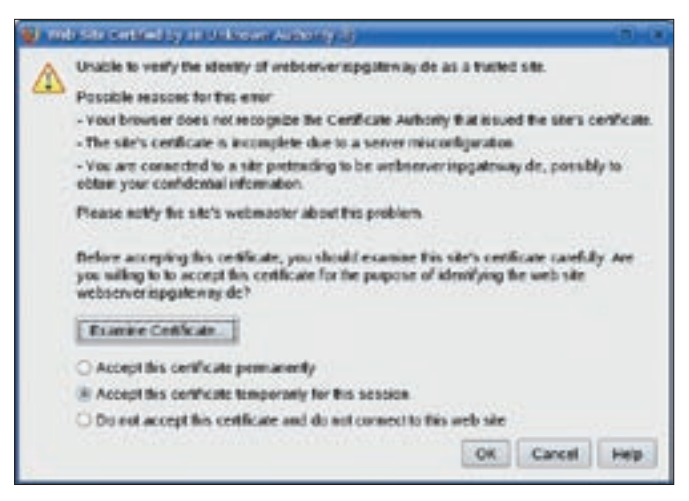
Figure 5: If Firefox shows you this fairly unintelligible, long, and badly formulated warning, you should consider not going ahead if you are handling sensitive data.

DNS server that your provider specified when your computer opened the Internet connection. If you request a page that this DNS server does not know, the DNS server turns to a server higher up the tree. If the server has the address in its cache, it will not need to perform a lookup. Cache poisoning attacks attempt to inject manipulated values into the cache. You'll learn more about Pharming and Cache poisoning in the article titled "Phish Story: Phishing, Pharming, and the threat of identity theft" on page 28 in this issue.