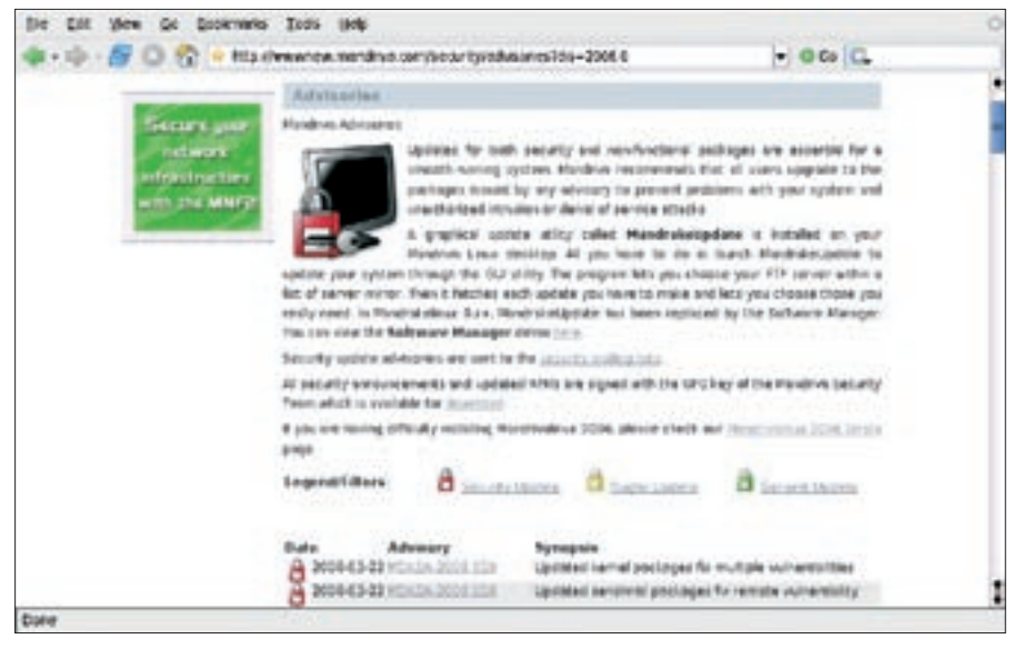
Figure 6: The padlock items in traffic-light colors make it easier for users to discover serious security bugs on the Mandriva pages.

wild goose chase due to DNS poisoning attacks.