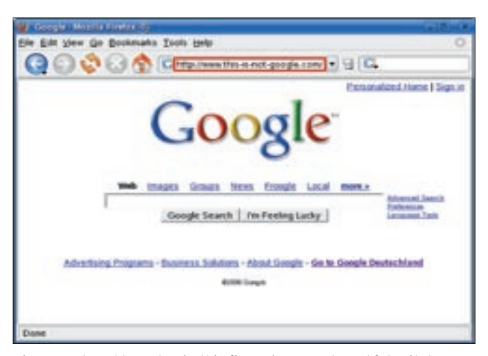
Figure 1: The address bar in this figure is a XUL-based fake; it does not show you the current page address but displays text predefined by the attacker.