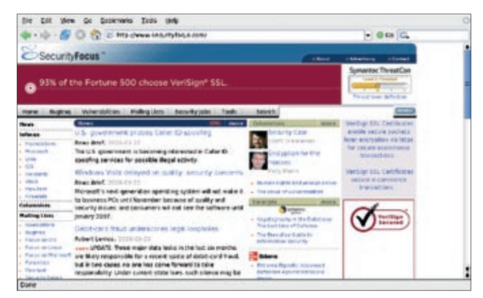
Figure 7: Security Focus has one of the biggest collections of security information on the Internet.

In reality, if the browser displays a certificate warning (Figure 5), you have to assume that security is endangered. Any bank or online shop that you trust with your money or credentials should demonstrate that it deserves your trust by giving you a working SSL/TSL connection.