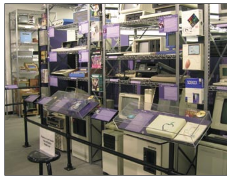
Figure 2: Silicon Valley LUG members can look for inspiration at the nearby Computer History Museum.

metadata. For example /nolog tells clients not to log an individual message.