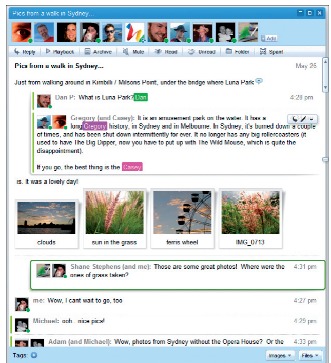
Figure 2: A Google wave can act as forum, chat, and live document at the same time.

Counter to what you might expect, a wave does not enforce access controls. A wave is merely a container for wavelets.