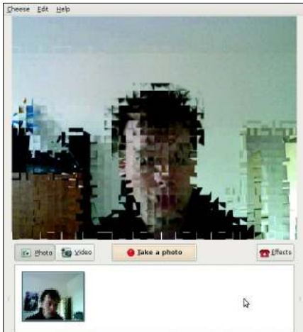
Figure 1: Cheese takes photos and records videos via a webcam.

are visualized. However, some of the effects involve operations that can slow down even a more powerful machine, especially if you apply them to videos.