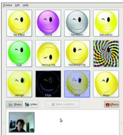
Figure 2: You can apply 12 different effects to the pictures you take with your webcam.

The WebcamStudio [8] project (Figure 3) targets users of these services, offering more than a simple reproduction of the image captured via the webcam. Users with cameras that support Linux,