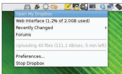
Figure 2: While Dropbox is synchronizing the data, a dialog helps the user watch progress.

To synchronize data, you first need to register your own machine with Dropbox. After completing the installation,