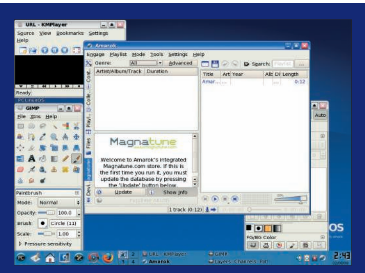
Figure 4: PCLinuxOS comes with the Amarok music player and other multimedia tools.