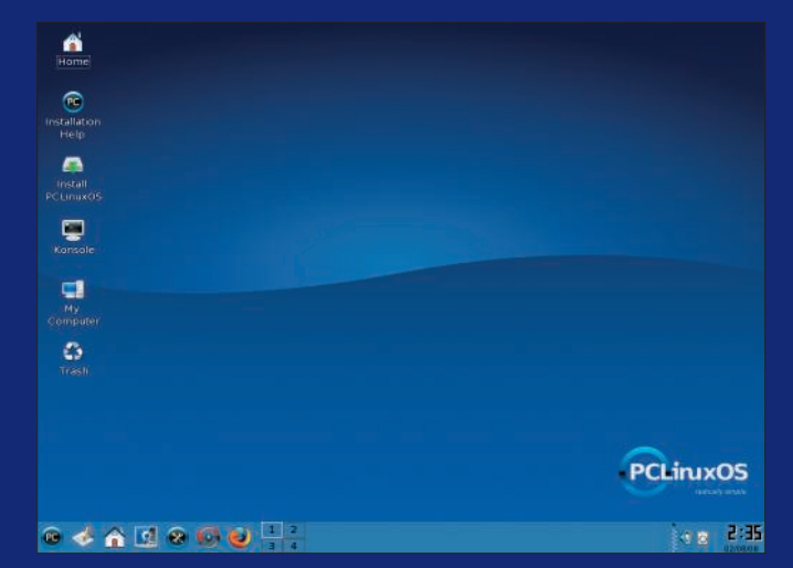
Figure 2: A simple user interface highlights the PCLinuxOS emphasis on ease of use.