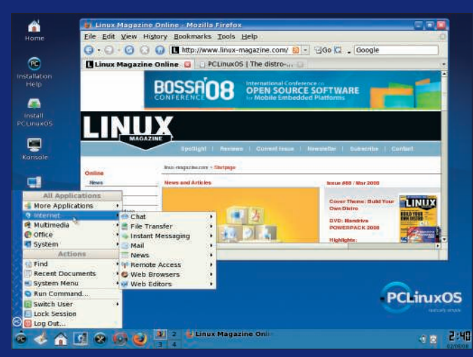
Figure 3: Navigate the web and find your way with a collection of handy Internet tools.