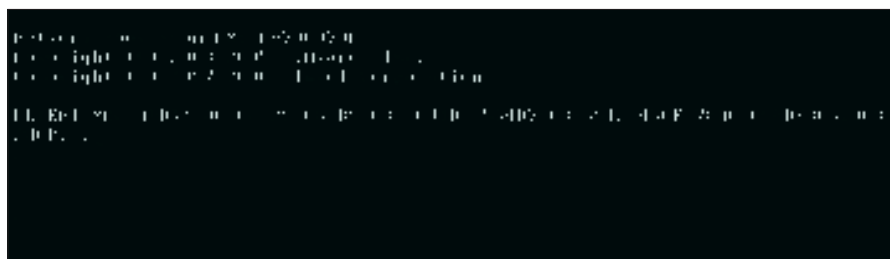
Figure 2: After booting, the client searches for the DHCPProxy on the PXE server.

If you have LittleHelper advertising its images on openSUSE, but Santa fails to find it, this could be an issue with the openSUSE firewall. To modify the configuration, go to the Security tab and select User .