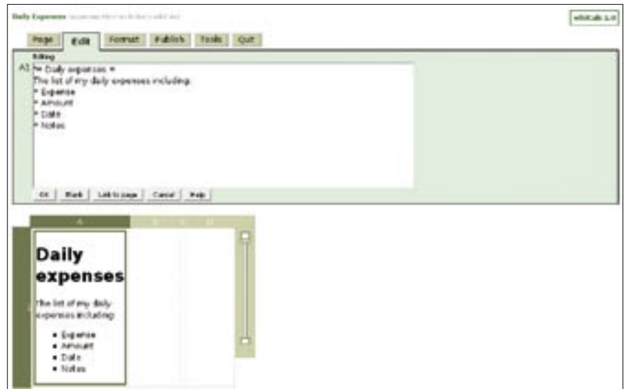
Figure 2: wikiCalc supports wiki-like markup.

Specify the column labels in a similar manner. To format the column labels, you can use the wiki markup, and wikiCalc offers a slew of formatting options under the Format tab. You can specify