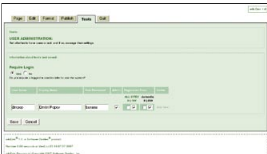
Figure 6: wikiCalc includes a simple yet effective user management feature.

wikiCalc is hands down the most capable and innovative web-based spreadsheet application out there, and as such, it offers a viable alternative to desktop applications like Gnumeric and OpenOffice.org Calc. If you plan to move from a desktop spreadsheet application to a web-based one, wikiCalc should be at the top of your list. ■