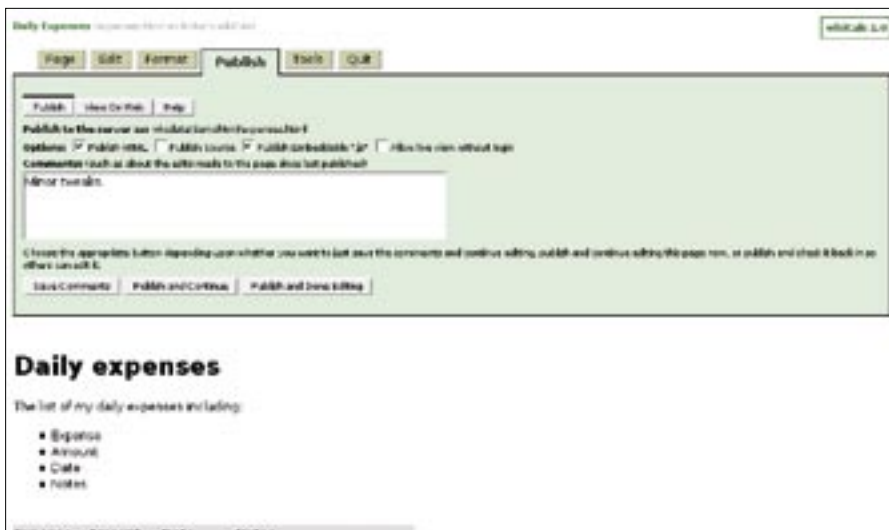
Figure 4: wikiCalc offers several ways to publish the spreadsheet on the web.