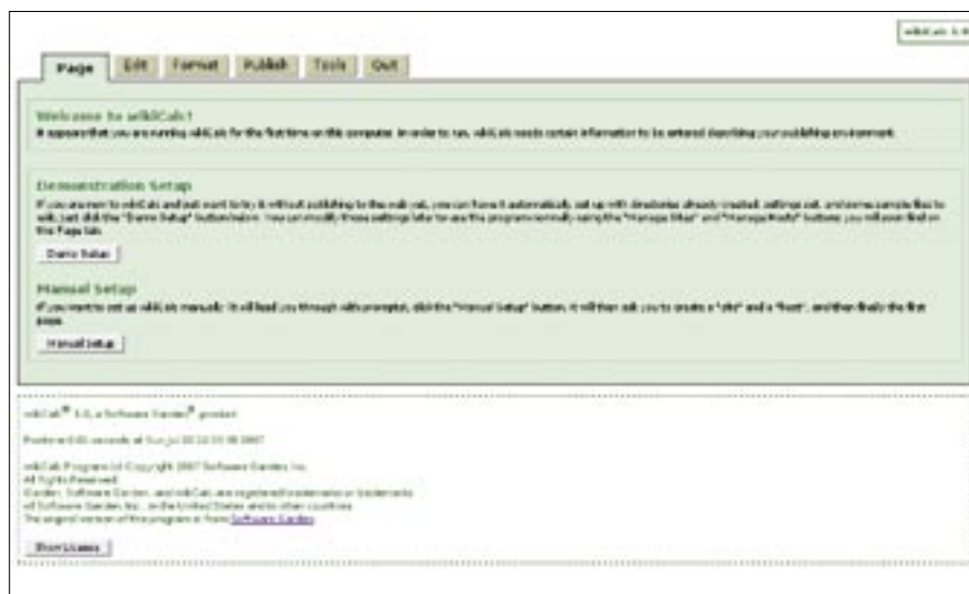
Figure 1: Setting up wikiCalc is a matter of pressing the desired setup button.

server or, if you want to publish pages on the same machine that runs wikiCalc, a path to a local directory (e.g., wiki-pages ). You should also specify the URL