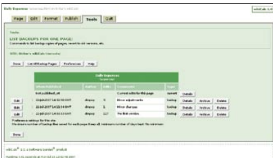
Figure 5: wikiCalc keeps track of spreadsheet versions and modifications.

In wikiCalc, press the Tools button and press Load from Text in the Tools Options section. In the Text to Load section, select the last option ( Tab-delimited with