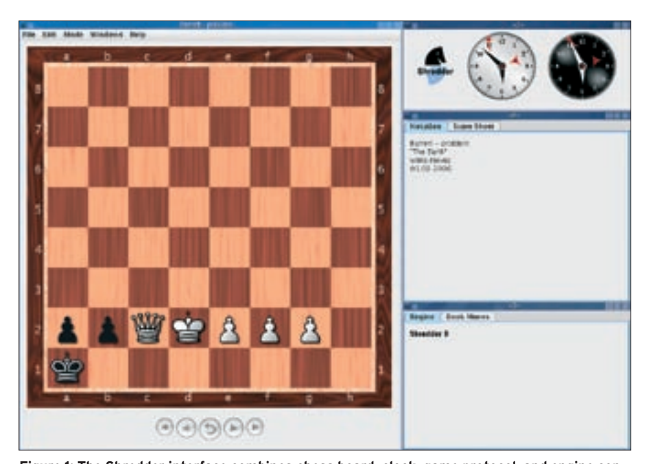
Figure 1: The Shredder interface combines chess board, clock, game protocol, and engine controls in a single GUI.

This said, Shredder 9 for Linux does have a 100MByte collection of openings, which you can download as a 27MByte compressed file after buying a registra-