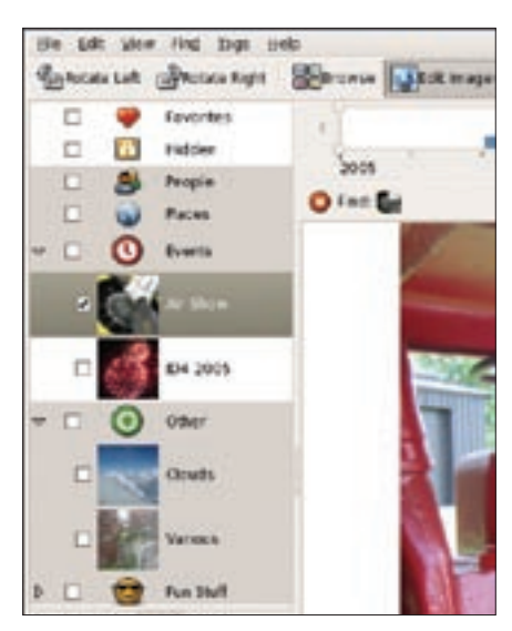
Figure 1: F-Spot uses tags to categorize photos; unfortunately, the tags are only available within the tool itself.

bonobo-activation-sysconf 2 --add-directory=2 /usr/local/lib/bonobo/servers