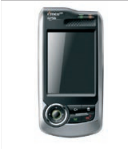
Figure 2: The recent ImcoSys quadband smartphone appears to be hacker friendly.

sor running a (slightly dated) 2.4.20 Linux kernel, 64MB of memory, and an expandable SD Card memory slot. Most interesting of all is the inclusion of an RS232-compatible serial port, indicating that this phone will be pretty “hacker friendly.”