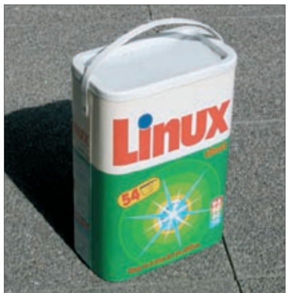
Figure 1: In my recent travels to Germany and Switzerland, I ran across a remarkable product known as Linux detergent.

The ImcoSys quadband (universally usable in most countries) smartphone sports the usual array of bluetooth and PDA functionality we've come to expect from the latest generation of Linux smartphones, but it also has some pretty cool extras – like built-in WiFi and even an internal GPS receiver (presumably for route planning applications that'll be made available later on). The technical specifications include a powerful proces-