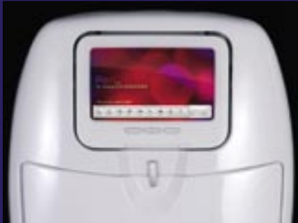
Virgin America's Linux-based in-flight entertainment system "Red".