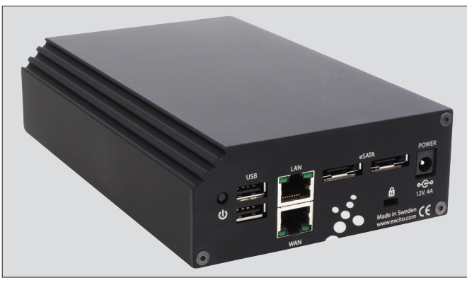
Figure 1: Bubba Two sports eSATA and USB ports as well as two Gigabit Ethernet jacks.

tasks Bubba Two is designed to perform. The back panel of the server (Figure 1) sports two Gigabit Ethernet jacks marked as WAN and LAN, two USB ports, and two eSATA ports for adding more storage and connecting a printer. Bubba Two is available in several configurations with different hard disk capacities: from a modest 80GB to a humongous 2TB. If you have a spare hard disk, you can also order Bubba Two without a disk. In case low noise and minimal power consumption are your primary concerns, you can opt for a version of Bubba Two with a 32GB solid-state disk. Excito also sells Bubba Storage, an exter-