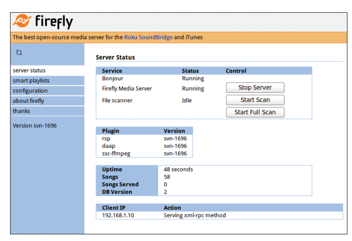
Figure 3: Bubba Two comes with a few useful applications, including the Firefly streaming server.

nal SATA hard disk enclosure that can be ordered with or without a hard disk.