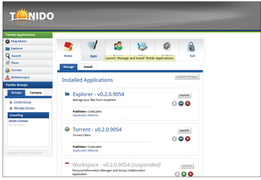
Figure 6: Enabling and disabling individual Tonido applications is easy.

Magazine. August 2009, pg. 82, http://www.linuxpromagazine.com/ Issues/2009/105/CLOUD-9