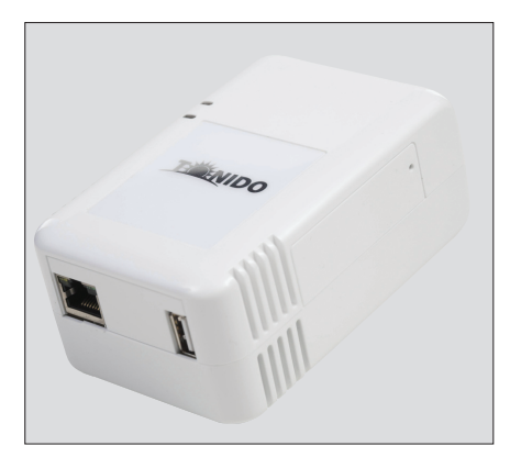
Figure 4: TonidoPlug.

TonidoPlug looks nothing like a conventional server (Figure 4). The device itself is based on the Marvell SheevaPlug plug computer, which looks like a slightly oversized power supply. TonidoPlug is powered by an embedded Marvell Sheeva CPU core running at 1.2GHz backed up by 512MB of DDR2 RAM and a 512MB flash disk. The device sports an Ethernet jack for network connectivity and a single USB port. The default 512MB of storage can be expanded by plugging a USB stick or a USB hard disk