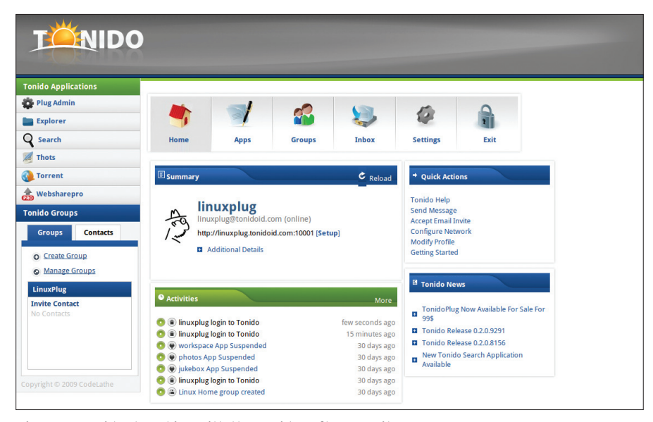
Figure 5: TonidoPlug ships with the Tonido software suite.

into TonidoPlug. As soon as you do that, TonidoPlug automatically detects the connected storage device, and you can use it right away. Better yet, TonidoPlug makes the storage device available on the network, so you can use the server as a simple NAS solution.