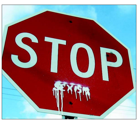
Figure 1: Luis Villa appealed to stop excluding people on the basis of physical characteristics. One talk at this year's Ruby Conference in San Francisco gave the audience good reason to doubt the general validity of this basic principle within the Ruby Community.

ganizations that offer Ruby courses at schools or provide targeted support to female programmers. The details were not fixed at print time and will depend on the amount of money raised.