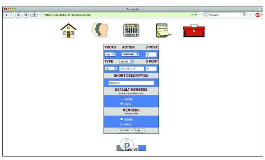
Figure 2: Modifying the ruleset: The example forwards port 80 on the firewall to an internal web server.

The database also needs some preparation. Unfortunately, the documentation tells users to cut and paste, an errorprone process; psql < / media/cdrom/server/TABLES.txt is an easier approach. Because the hard work in the background is handled by a couple of shell scripts that need to run periodically, you