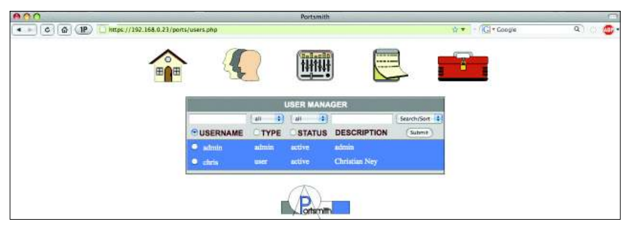
Figure 1: User accounts are modified easily by adding rules.

is needed. Scripts running in the background regularly generate the corresponding iptables commands from database extracts and then add them to the ruleset.