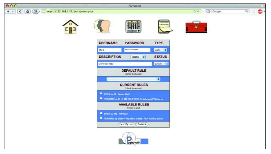
Figure 5: Not so easy for non-technical users: setting enabled services.

to initiate changes. One potential use would be hardening access to an internal web mailer or other services, such as Sun Secure Global Desktop [10]. With encrypted connections, Portsmith could serve as a VPN replacement. If you prefer a genuine VPN solution, you can easily add IPSec software, such as strongSwan [11] or OpenVPN [12].