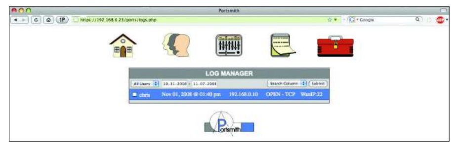
Figure 3: The Log Manager tells you who enabled what rule.

need to set up cron entries for the scripts. Relaunch the server by typing /etc/