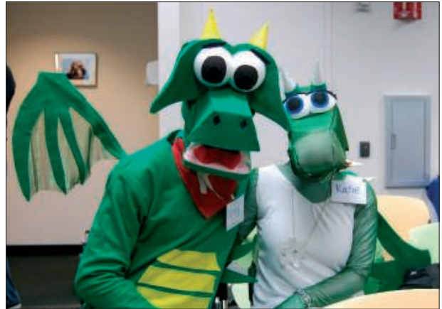
Figure 2: KDE Mascots Konqui and Katie joined the event.

Looking back at the two-year development phase, the KDE community appears to be optimistic and strengthened. To emphasize the growing importance of KDE in the Americas, developers agreed to switch upcoming meetings between the Academy in Europe and venues in the Americas every six months. ■