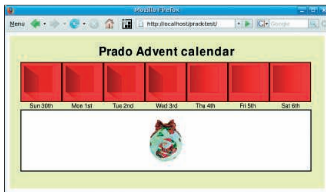
Figure 1: A simple interactive application: the doors of an Advent calendar open with a mouse click; The prize appears in the white field below.

An example application that implements a web-based Advent calendar illustrates how easy it is to program with Prado. The doors of the calendar open with a mouse click (Figure 1). Doors that