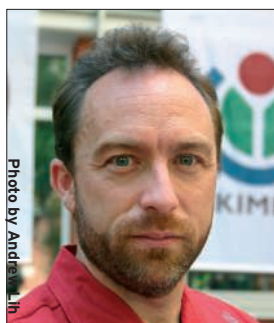
Figure 3: Jimmy Wales banks on the community. Although Wikipedia is a great success, Wikia Search has a long way to go.