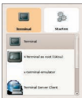
Figure 2: The Gnome Launch Box "Application Launcher" finds applications, files, and email contacts, as a precursor to Gnome Do.