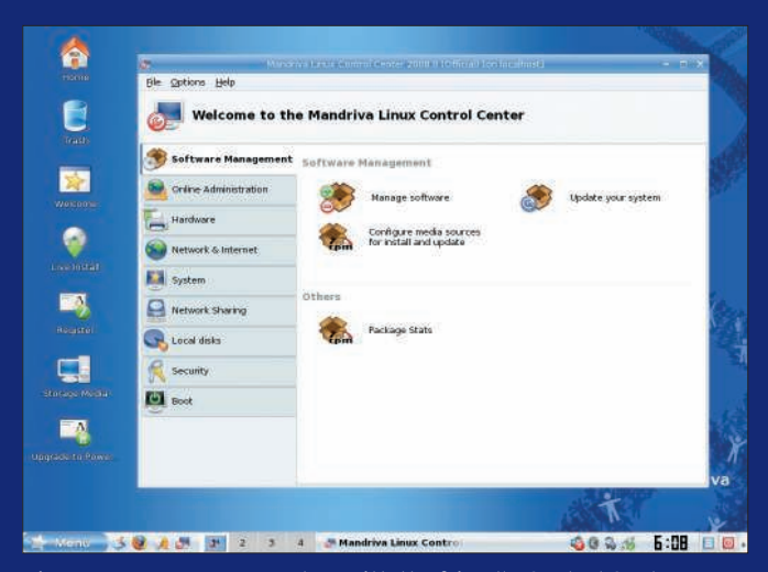
Figure 4: Manage your system with the friendly Control Center.