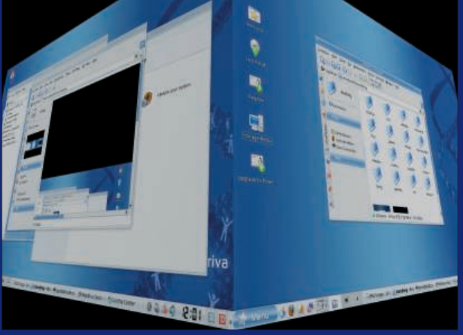
Figure 2: Compiz Fusion provides exotic 3D effects.