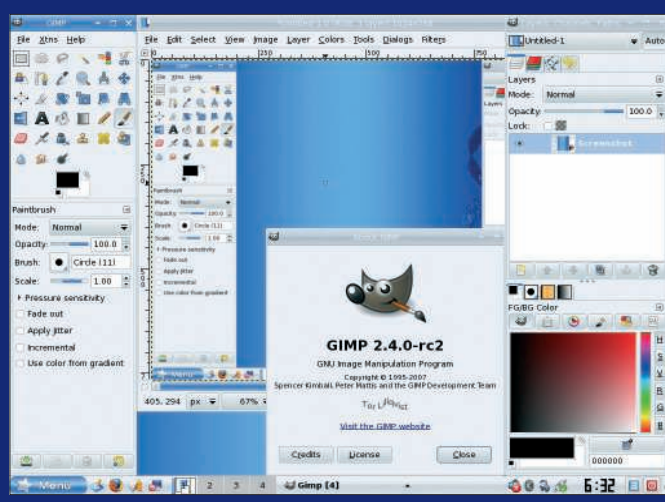
Figure 3: Create and edit images with GIMP 2.4.