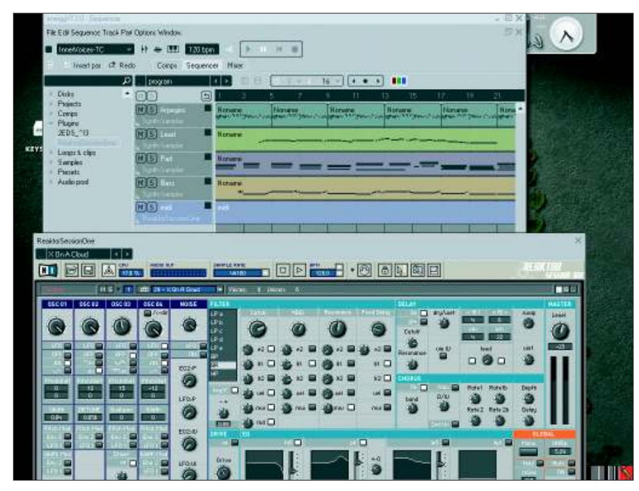
Figure 4: energyXT2 runs Reaktor in JAD 1.0.

Despite their current differences, in many ways, these systems tend toward the same end: 64 Studio has a 32-bit version, complete with Wine/wineasio support, and JAD will eventually be ported to 64-bits; both systems run Java, both do Flash, and both have live disc images. Your choice of 64-bit system or 32-bit system will depend on your critical needs.