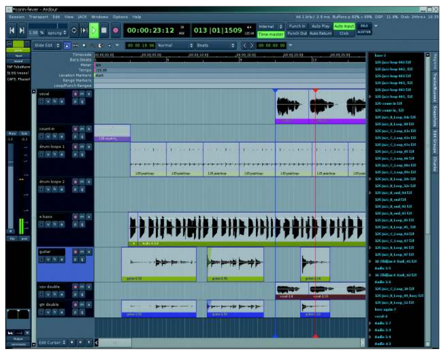
Figure 2: 64 Studio with the Ardour2 digital audio workstation.

I have some long-established practices in my production work. First, I'm a fanatic about weight. I jettisoned the Gnome desktop immediately to install Fluxbox, despite having more than sufficient hardware resources. Next, I must have support for my preferred applications. For recording and mixing, I rely on Ardour, Audacity and ReZound for