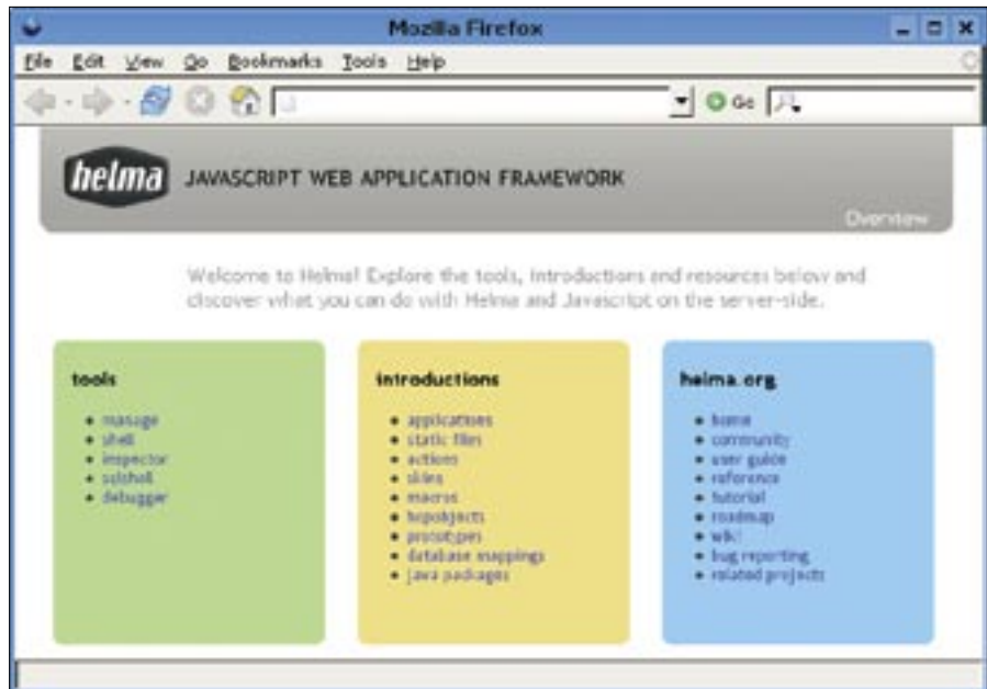
Figure 2: The Helma "Welcome" application greets you when you first access the server.

The next few paragraphs describe some programming details for the RSS reader