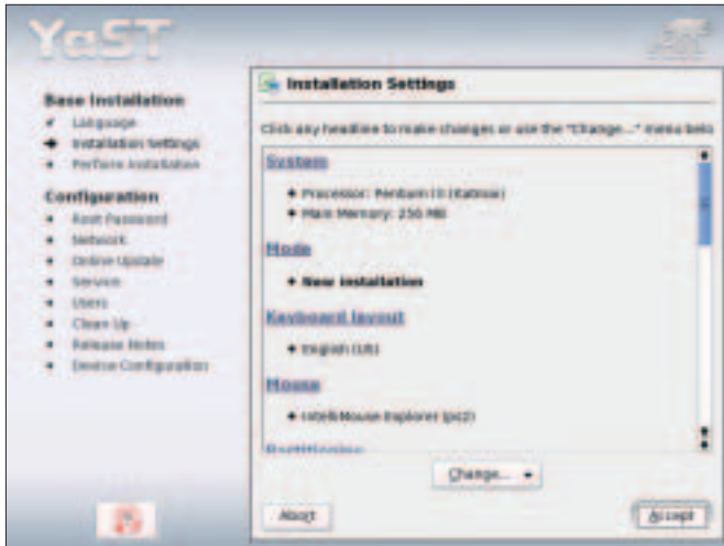
Figure 1: YaST installation of SLES9 is very similar to YaST installation of SLES8.