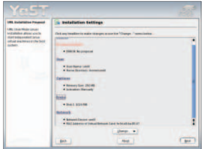
Figure 4: YaST now contains a module for User Mode Linux, a popular tool that supports virtual machines within a host system.

heartbeat high availability system for clustering and failover. Heartbeat monitoring refers to the ability of one node to detect that another node is down when it fails to detect the missing node's "heartbeat." According to Novell, SLES9 can be tuned to detect a missing heartbeat in less than one second. This early detection allows for sub-second failover in the most critical of environments. Failed nodes can be re-introduced automatically or manually.