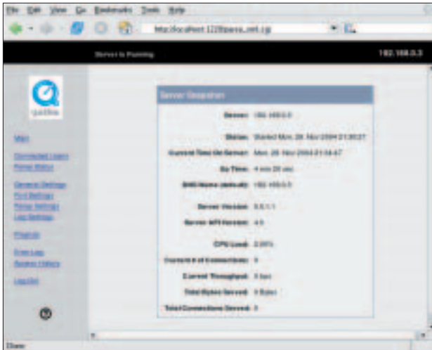
Figure 1: The main window of the web interface with statistics for the active server.

page; this password is used for incoming MP3 streams, which the server is able to distribute.