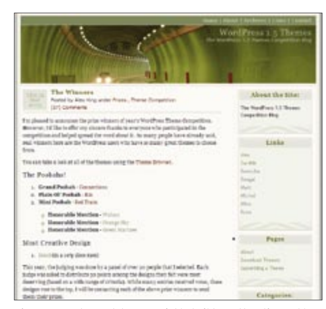
Figure 1: Wordpress lets you quickly build an attractive weblog.

If you prefer to modify an existing theme rather than installing a new one, you can use the Wordpress theme editor to do so. Select Themes | Theme Editor to launch the editor. This lists the files belonging to the current theme and lets you edit the themes in the integrated input box. Of