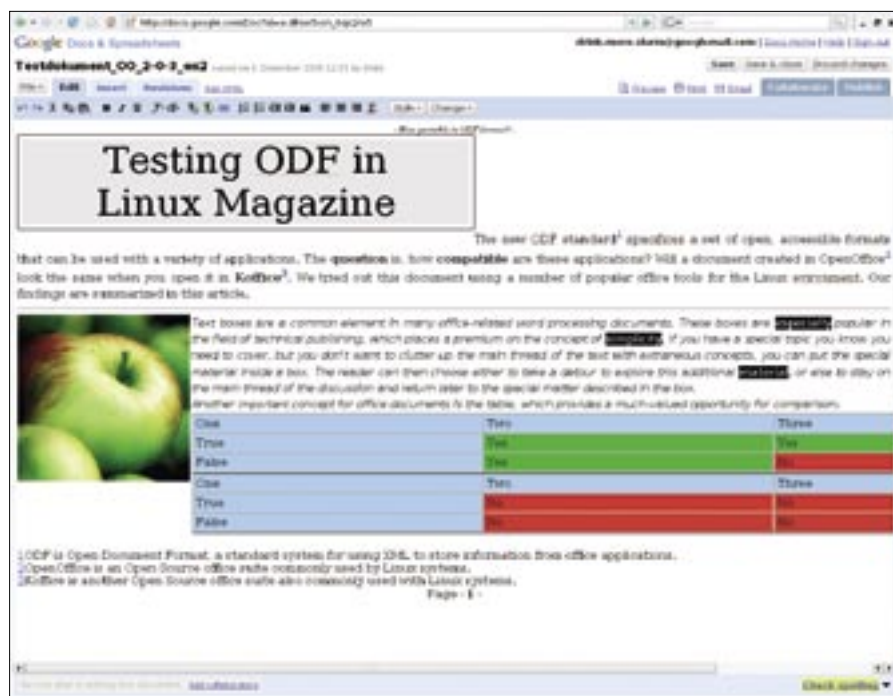
Figure 4: Writely is no worse than the offline contenders, but it displays the elements as an HTML page rather than a text document.

display the reference document in an A4 frame, but rather distributed it over the whole width of the screen. Because the office software resides on the server, it is difficult to know whether the application might be changing over time, but when I first tried to open the document, I got a result similar to the recreation shown in Figure 4. When asked to print the results, Writely squashed the whole of the document onto a single page.