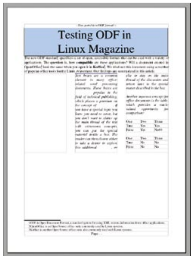
Figure 2: Presto! If you save the document in AbiWord and open in OpenOffice again, you end up with something resembling a completely new document.